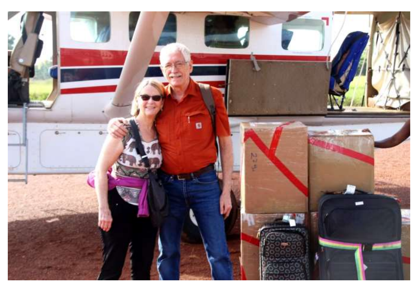
Gee it's good to be together again!

Our two vehicles are still down with broken transmissions so one borrowed car and one motorcycle made several trips to get people and luggage back to the office which is fortunately only 5 minutes from the airstrip! It sure beats the 7-8 hour drive we've had in the past to/from Kampala.